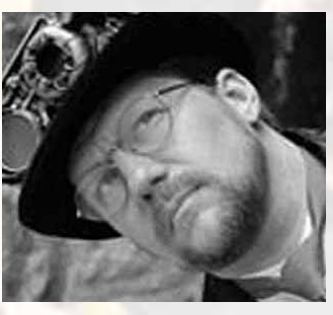
Author: Tee Morris